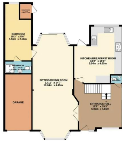
GROUND FLOOR 1230 sq.ft. (114.3 sq.m.) approx.